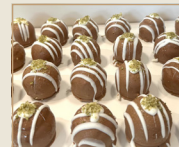
CHEESECAKE CHOCOLATE BALLS