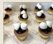
CHEESE SNACK ROUNDS