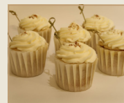
CHEESE CARROT MUFFIN